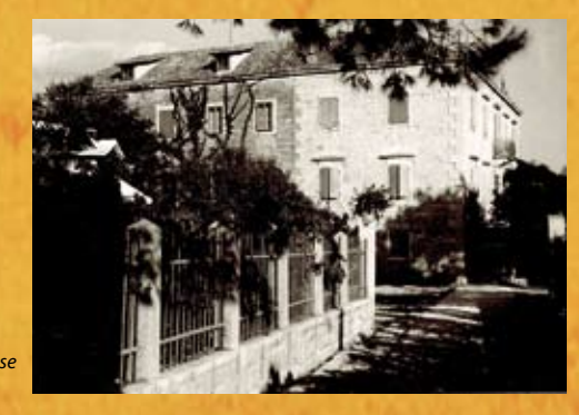
Kukučín's hou at Brač

In April 2008, House on the hillside had a premiere as a drama for the stage in the SND theatre