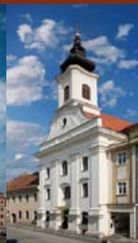
Church of St Anne