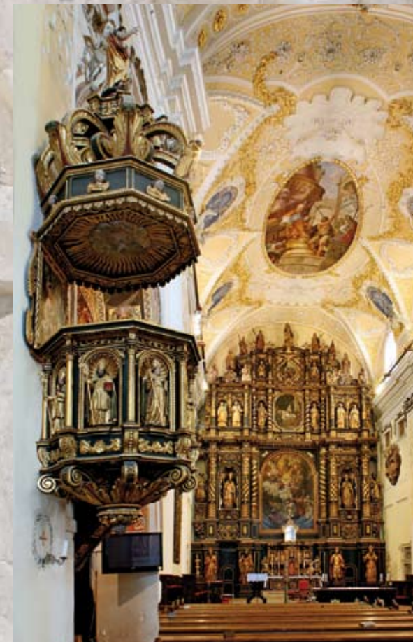
Interior of the Cathedral of St John the Baptist