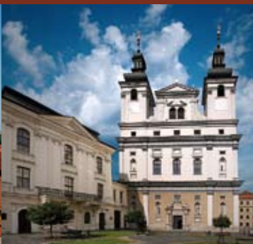
Cathedral of St John the Baptist