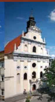
Church of St Joseph