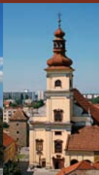
Church of St Jacob