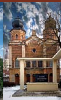
Synagogue status quo ante