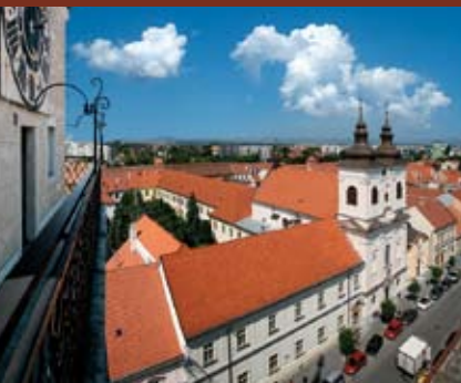
Church of the Holy Trinity, viewed from the Town Tower