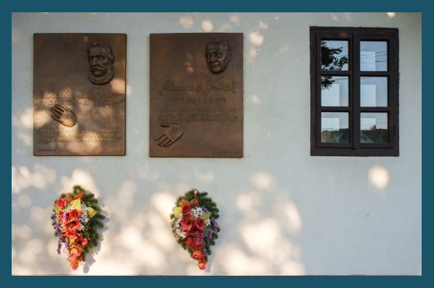
Two famous Slovaks of different eras, Alexander Dubček and Ľudovít Štúr, were born not only in the same village, Uhrovec, but also in the same house, which since 1965 has been designated a national cultural heritage site

Alexander Dubček (1921–1992) is one of the most significant figures of modern Slovak history, recognised at home and abroad as a democrat and European. For almost 16 months from 1968 to 1969 he was leader of the Communist Party of Czechoslovakia (KSČ). His name is synonymous with the 1968 Prague Spring and the unsuccessful attempt to establish "socialism with a human face" in Czechoslovakia. After his expulsion from the Communist Party, he spent the twenty-year period of "normalisation" under tight surveillance, before returning to domestic and European politics when the Cold War ended.