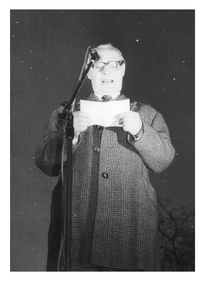
A tribune of the people, Dubček addresses demonstrators in Bratislava's Slovak National Uprising Square in November 1989

All Slovak hopes that Alexander Dubček might become Slovakia's first democratic president after the split of Czechoslovakia were extinguished on 7 November 1992, when he died of injuries suffered in a car accident.