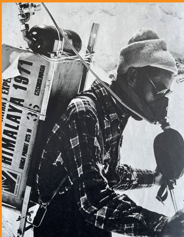
Oxygen equipment was used only for medicinal purposes

The only member of the German-Austrian first successful expedition who actually reached the summit was the legendary Austrian climber Hermann Buhl. By the end of 1970 Nanga Parbat had been climbed a further