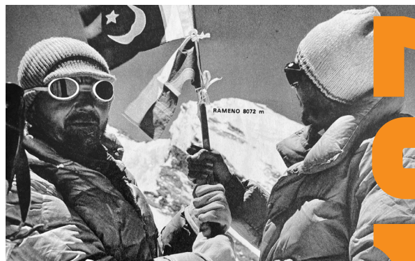
Standing on Nanga Parbat's foresummit at around 11 a.m. on 11 July 1971, with the Shoulder ('Rameno') and the summit of Nanga Parbat in the background

two times. In the 1950s expeditions were vying to make the first ascents of Himalayan eight-thousanders, but Czechoslovak mountaineering was unable to join the race. It was not until 1958 that Czechoslovak climbers were able even to visit the Caucasus Mountains in the then Soviet Union, where they recorded one success after another and gained valuable experience.