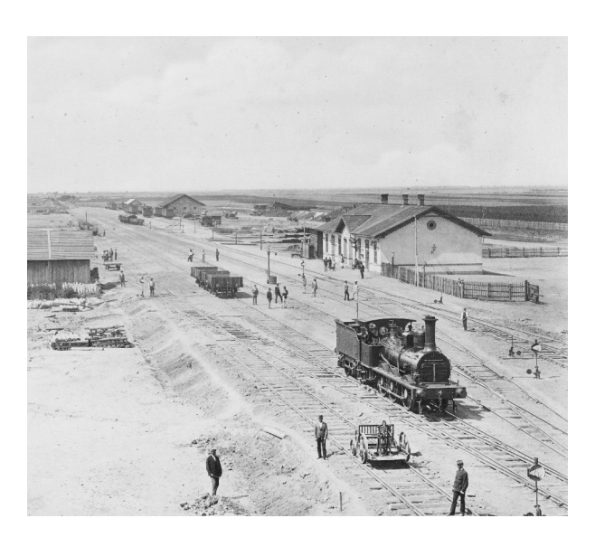
The new steam line at Trnava railway station

The line was to connect five royal towns - Bratislava, Svätý Jur, Pezinok, Modra, and Trnava and it was designed to be powered by animal traction. In 1837 Baron von Walterskirchen's circle presented a project for the construction of the railway to the Royal Hungarian Governorate and asked it to furnish the experts necessary to draw up the project and its budget. The track was designed in such a way that the curves and artificial structures were already suitable for steam operation. After a smooth start, the construction work gradually began to run into hitches that ended up delaying the line's launch. The summer of 1840 saw the completion of earthworks near Svätý Jur, the finishing of the railway station in Bratislava and the procurement of 12 passenger carriages. Trial operation of the Bratislava-Svätý Jur section began on 27 September 1840. Owing to construction-related problems, the full line to Trnava was not put into operation until 1 June 1846.